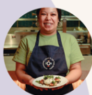
Surya FreshLife 2024 @Searcys J S Society (hospitality)