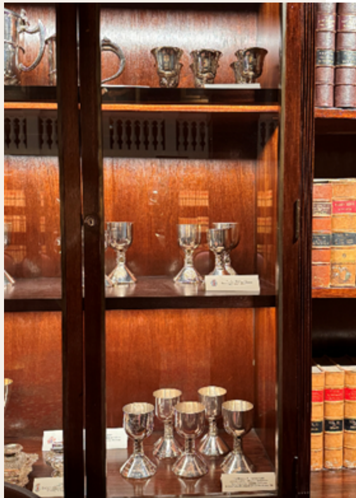
Our Cork Cup on proud display in the Cabinet in the Members Room of Chartered Accountants' Hall

Last year we received £13,600 in legacies and I am delighted to say that so far this year we have received another 3 legacies totalling £25,000! Our Cork Fund now stands at £40,000. We have started our journey so please do help us build it for the future.