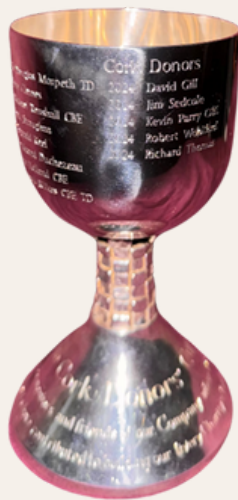
Picture of the Cork Fund Cup with the newest names engraved on it

The principal aim of the Cork Club is to encourage members of the Livery Company to remember the Livery Charity in their wills with legacies so that we can build the capital of the Charity investment fund enabling us to increase our grant giving. We have received both legacies left in wills of members, and 'living legacies' where members have gifted a donation to the Cork Fund. The trustees are so appreciative of the generosity and thoughtfulness of members who have donated.