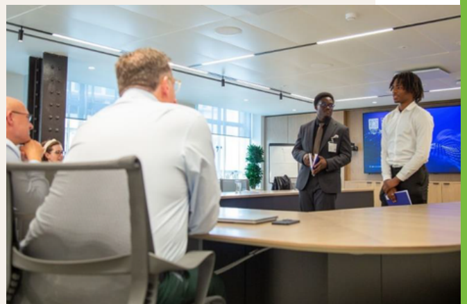
Practising their presentation skills at Page Group